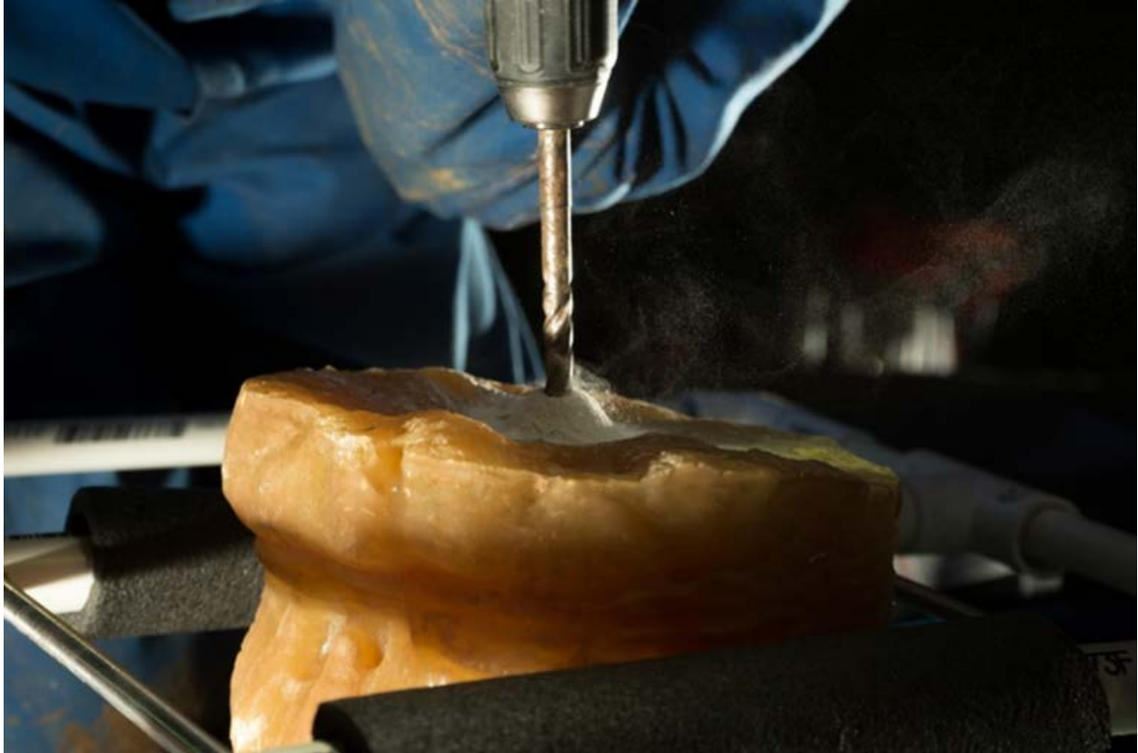
Mike drilling a hole in the base of a large stalagmite that is being held in place by the Speleclamp. A 3/8" stainless steel reinforcing pin will be used to connect the upper piece of the stalagmite.