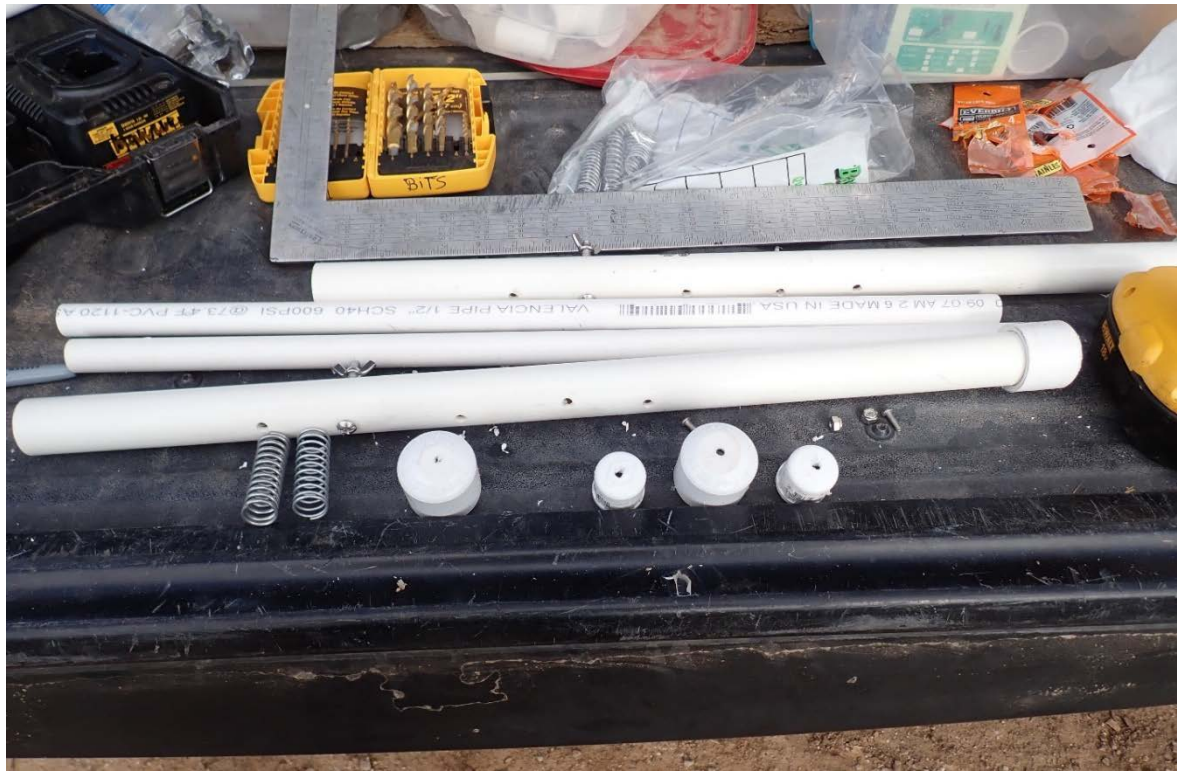
Different sized caps to use on the piston end of the Stalactijack to fit most sizes of stalactites.