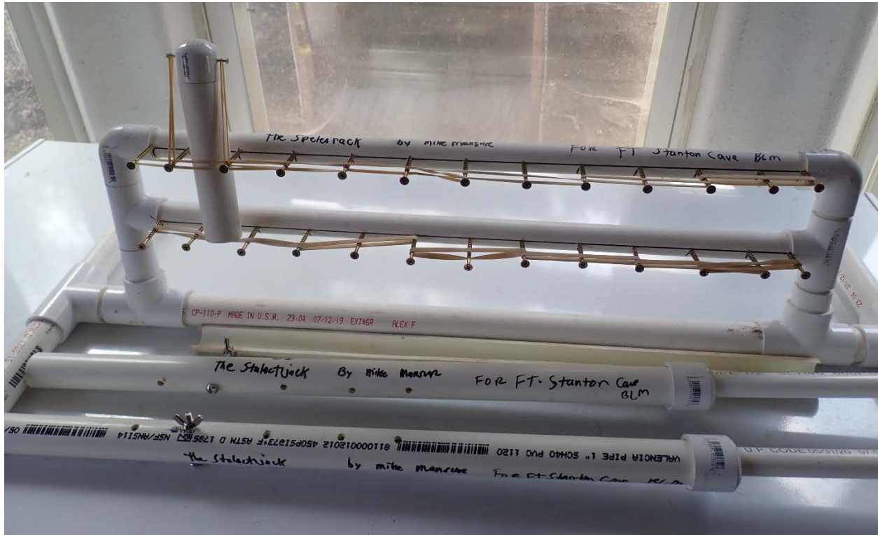
The completed Speleorack.

The fourth invention is the Speleorack. It is used for firmly holding formations that have been epoxied together in a vertical position. It can hold up to 40 formations at one time. I used ½" PVC and 3" zinc-plated screws to hold the rubber bands, which in turn secure the repaired formations to the Speleorack.