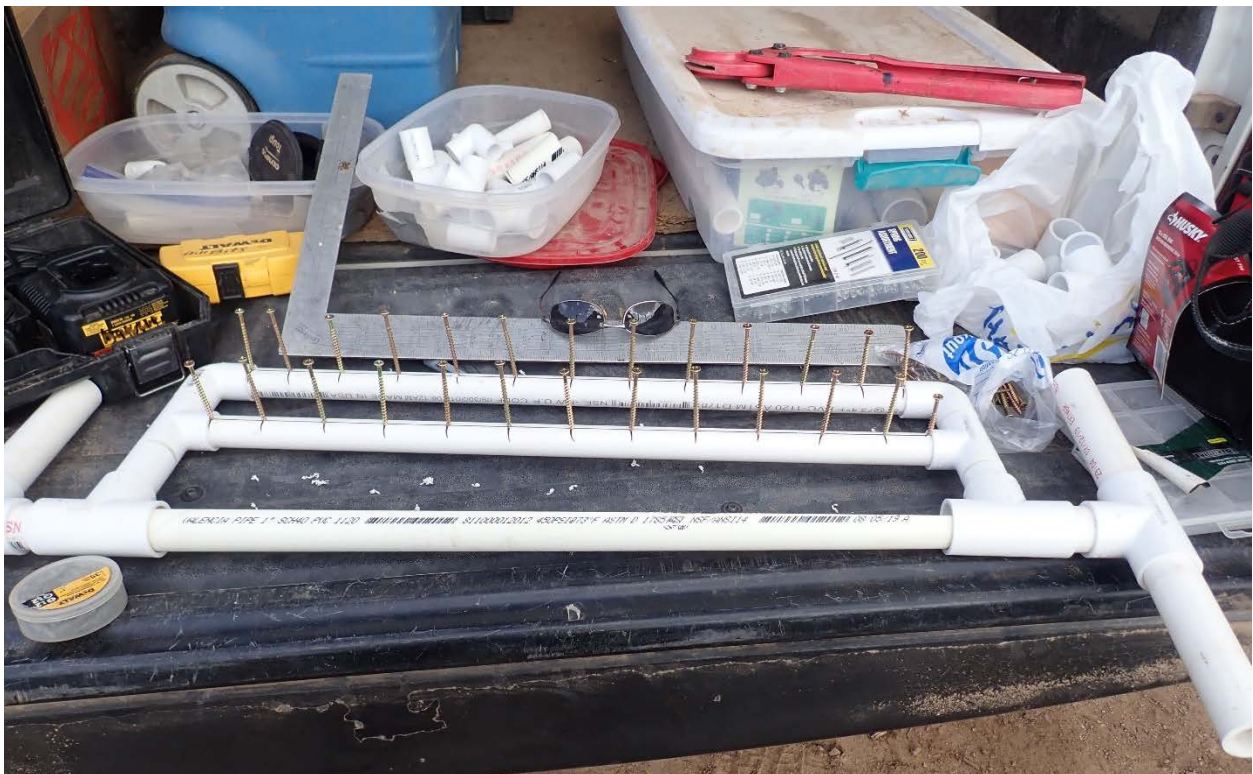
Adding the 3" zinc-plated screws two inches apart onto the Speleorack. I ended up placing them onto the back side of the device as well due to a large number of formation repairs in Cottonwood Cave.