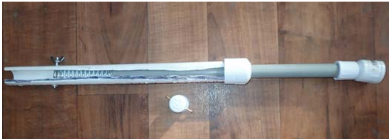
Cut-away view of the spring-loaded Stalactijack.