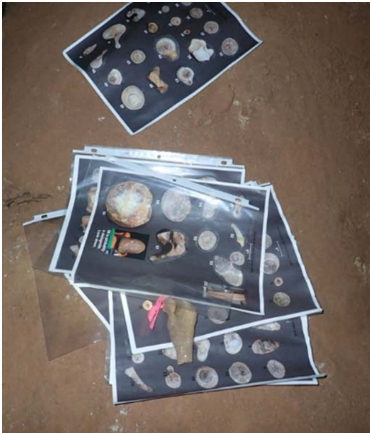
Todd's printed photos we use to match broken pieces to their point of origin.