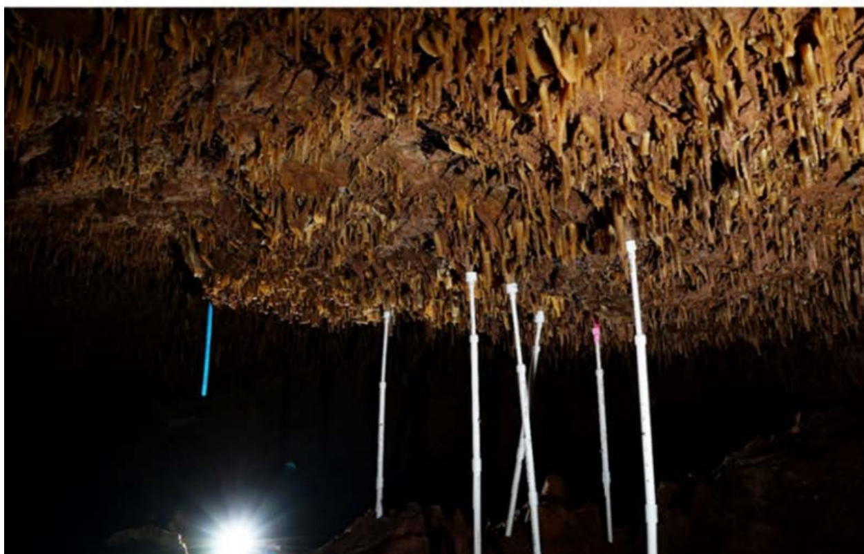
Our Lake Room worksite before and after the repairs were completed and Stalactijacks were placed.