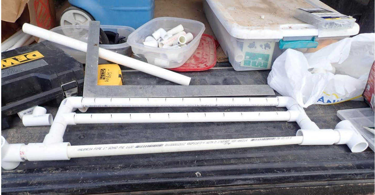
Building the Speleorack on my tailgate.