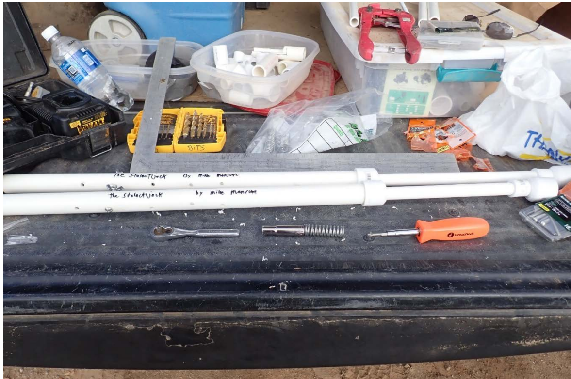
Building the spring-loaded adjustable Stalactijacks on my tailgate.