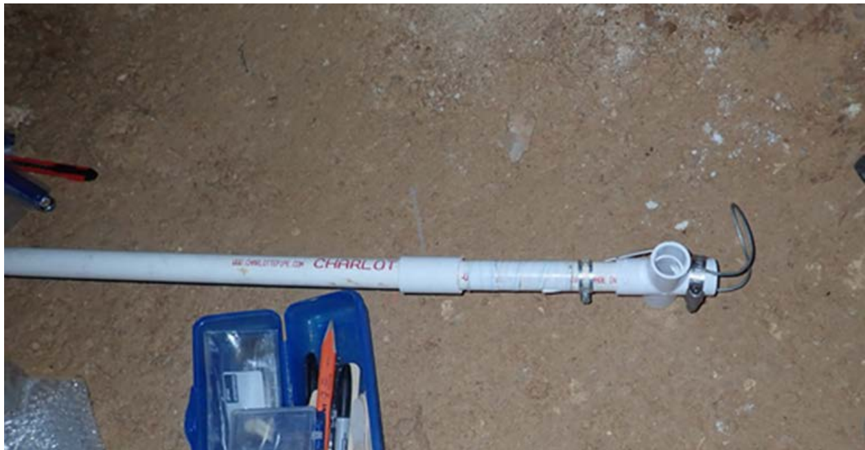
The PVC and stainless steel Speleorake.