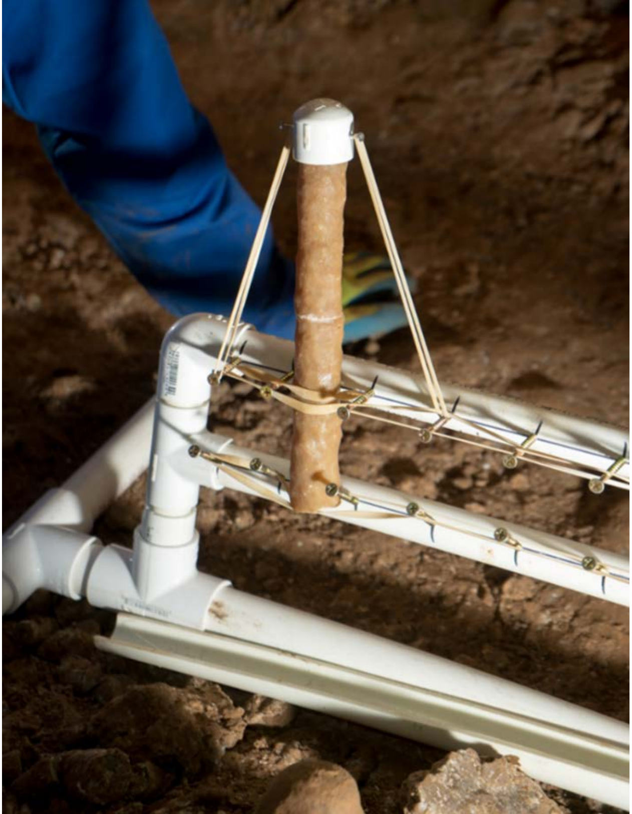
The new Speleorack holding a repaired stalactite.