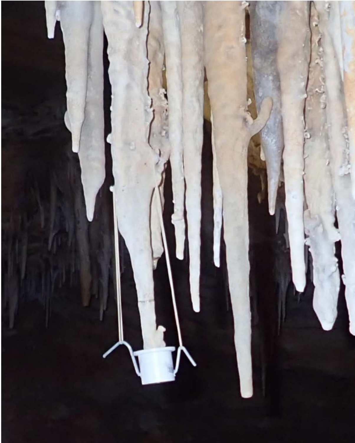
A Speleocup in use.

The third invention is the Speleocup. It is a PVC cap with two stainless steel screws or aluminum wire that we connect with rubber bands to a stainless-steel clamp attached to the stalactite base.