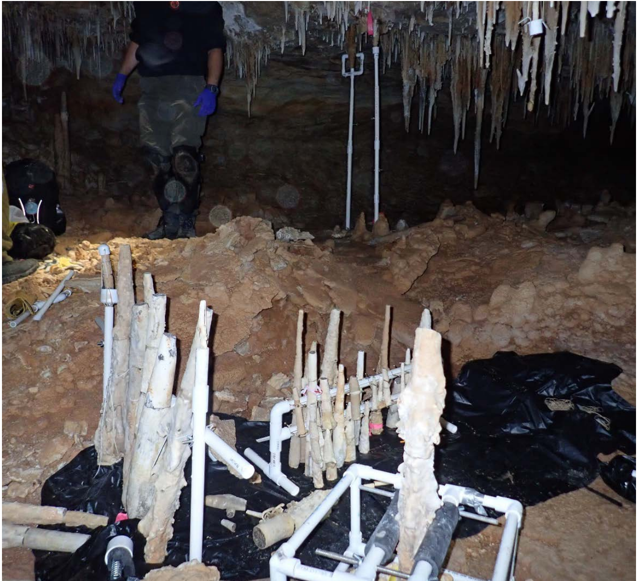
Fully loaded Speleorack and Speleoclamp in foreground in Cottonwood Cave, with Stalactijacks and Speleocup in background.