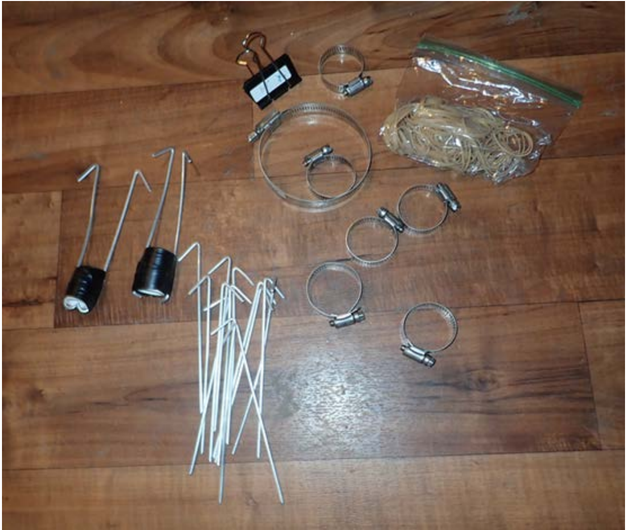
Parts to make my Speleocups.