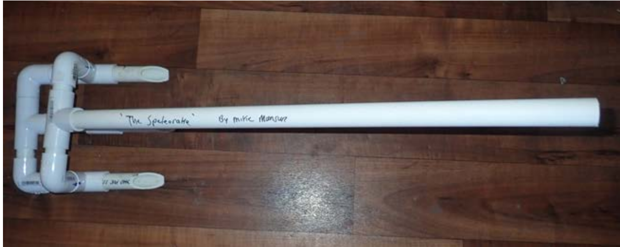
The all-PVC Speleorake.

The last invention I show here is the Speleorake. It is a tool for retrieving broken formations out of pools. It comes in two varieties (shown below).