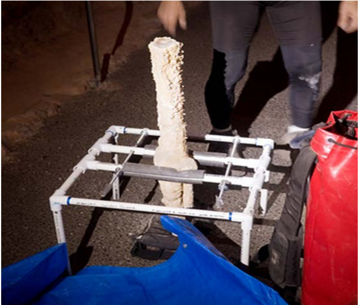
The Speleoclamp in use in Carlsbad Caverns.

My next invention is the Speleoclamp. It holds a formation tightly in place while we drill holes for the placement of stainless-steel pins to provide rigidity to the epoxied joint. I needed a means of supporting the repaired formations while the epoxy set, and to hold the formation tightly while I drilled the holes to place stainless steel pins for joint reinforcement. I invented and fabricated a device that would hold these formations under various cave conditions. I decided to use \frac{1}{2} " PVC pipe to make a 24" X 24" X 18" high clamp. I glued the pieces together at the top tier, but left the lower tiers unglued so I could add height if necessary. I used \frac{3}{4} " PVC "T" s and piping to make sliding rails to serve as the clamp. I drilled \frac{3}{8} " holes on these pieces to then install \frac{3}{8} " all thread, and used \frac{3}{8} " nuts and wing nuts to allow me to clamp the formation in place. I also added \frac{3}{4} " foam pipe insulation to serve as a cushion on the rails to prevent possible damage to the formation. I made this device on September 12, 2018.